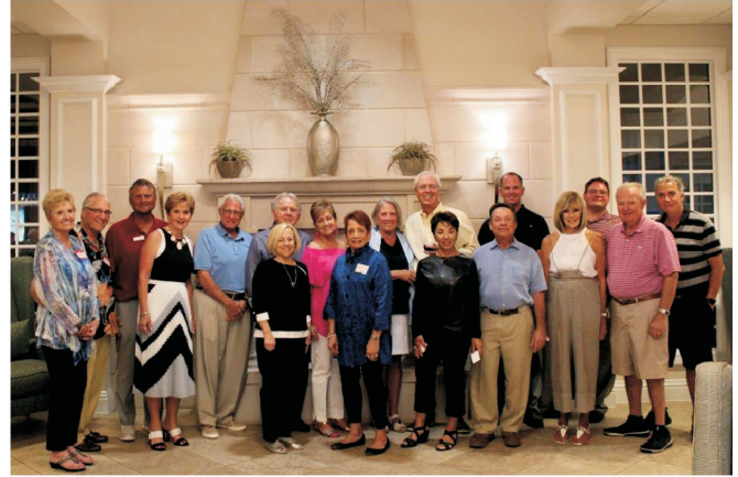
Members who opened their residences for the Home Tour