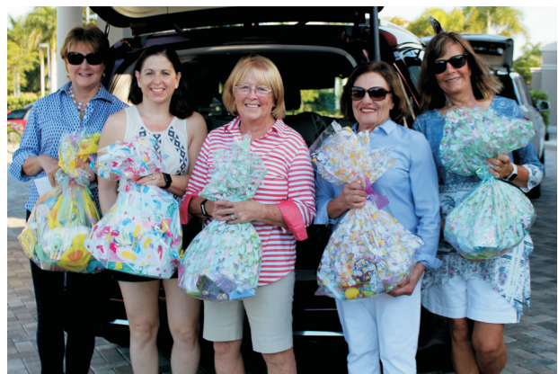
Ladies 9 Hole Golf League delivering Easter baskets to children in the abuse shelter (ACT).